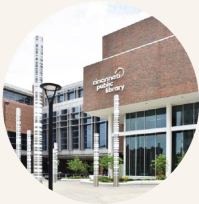
Downtown Main Library South Building & Plaza Renovation