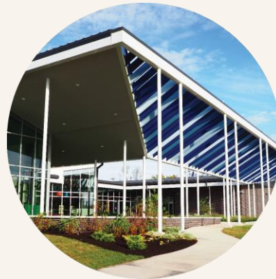
Forest Park Relocation and New Build