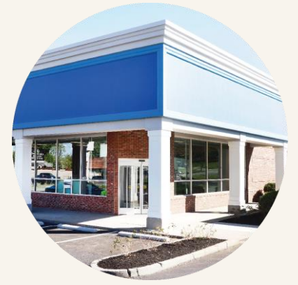
Mt. Healthy Relocation with Larger Building