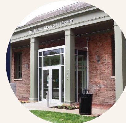
Hyde Park Improved Accessibility